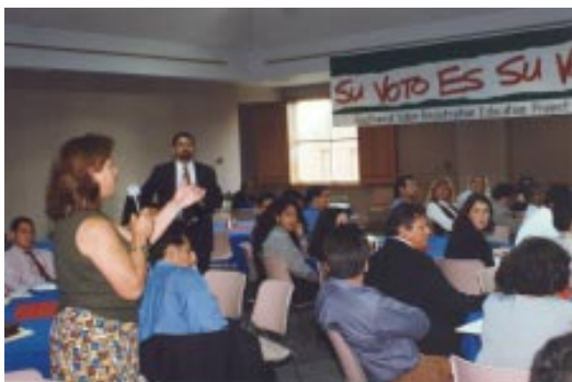
(Latino Academy 2000 students attending class)

Latino academy graduates will be instrumental in helping their communities take advantage of these opportunities by mobilizing them for upcoming elections in which they can elect the candidates of their choice. The curriculum taught at the Latino Academies will concentrate on voter registration and GOTV techniques, Latino demographics, ethics and accountability, community service, media training, basic principles of community organizing, redistricting issues and local fundraising. Political experts as well as Latino elected officials will teach the classes.