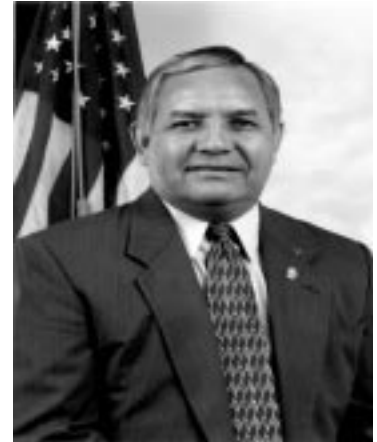
(Honorable Silvestre Reyes, U.S. Representative, D-TX Chair of the Congressional Hispanic Caucus)

Congressman Silvestre Reyes (TX), chair of the Congressional Hispanic Caucus followed Governor Perry's address with remarks echoing sentiments of the importance of involvement in the civic process. "Thanks to last November's election, it has become unavoidable to recognize that our efforts to ensure Latino voter empowerment go beyond promoting a large voter turnout," said Congressman Reyes. Just getting people to the polls is not enough. We have to make sure that every vote cast is a vote counted. That is why we as Members of Congress are now focused on election reform. Election reform is about increasing the accuracy of elections to reflect the will of the voters," added the Democratic Congressman from El Paso, Texas.