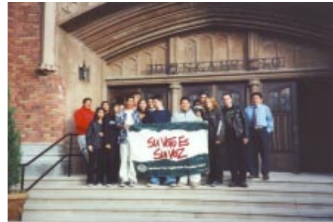
(SVREP's volunteers celebrate a successful gotv campaign)