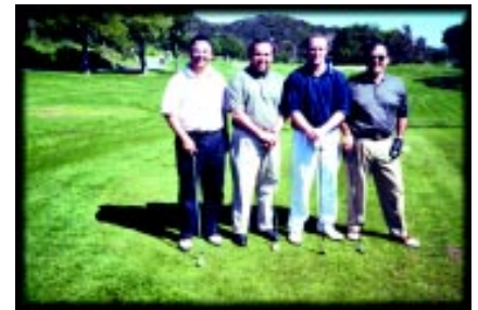
(Golf Tournament Participants)

Throughout the 18-hole golf tournament, contestants participated in special contests that including the longest drive, the closest to the pin and hole-in-one competition. After the tournament, a late lunch was served and attendees participated in SVREP's auction and raffle. Prizes raffled included a Disney gift basket valued at $300.00, a television set, a prepaid AT&T cellular phone, two boom boxes, a set of golf clubs and assorted golf equipment. Among the items auctioned were round-trip travel for two to Cuba and premier seating for the LA Dodgers, LA Kings and Los Angeles Clipper.