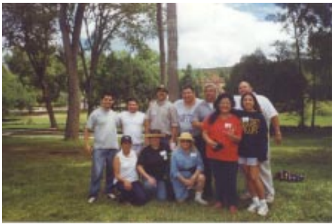
(Latino Academy Graduates of 2000)

Latino community leaders throughout the southwestern states including Florida will once again, convene this year for the Southwest Voter Registration Education Project Latino Academy scheduled for McAllen Texas and Sedona Arizona. Both academies will teach participants the specialized training on techniques and strategies on how to organize, motivate and lead their communities in the upcoming 2002 primary elections. SVREP will host this year's Latino Academy 2001 in McAllen, Texas August 9-12, where 50 community leaders and youth will participate in the training.