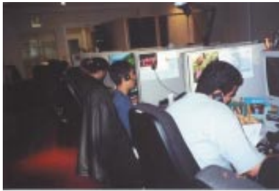
(Volunteers calling voters at San Pedro phone bank)

During the April 10th Los Angeles Mayoral election, eleven full-time coordinators mobilized hundreds of volunteers who staffed phone banks in crucial Latino communities throughout