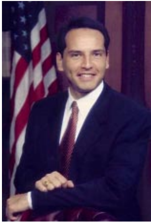
(Honorable Ed Garza, Mayor of San Antonio)

On May 5, 2001, the Latino electorate was crucial in the election of Ed Garza as mayor of San Antonio. Garza defeated Tim Bannwolf as he carried eight of the ten city council districts in San Antonio. SVREP voter registration drives were instrumental in turning out new registered voters for this important city election. SVREP conducted a get-out-the-vote (GOTV) campaign in city council District 6 in the west side of San Antonio, as volunteers staffed phone banks contacting thousands of voters during and prior to election day. The overall turn out on election day in San Antonio was 17% of all registered voters. In District 6 the turn out was 19%, higher than the city over all. Garza was expected to have a close race against Bannwolf, yet he obtained 59% of total votes cast.